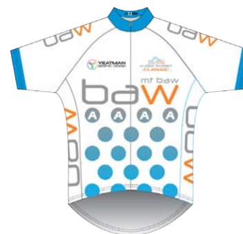
A Grade Men