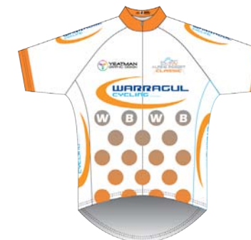
B Grade Women