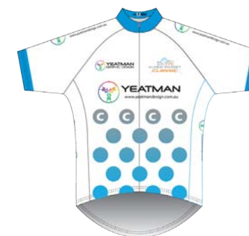
C Grade Men