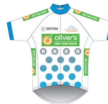
B Grade Men