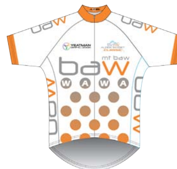
A Grade Women