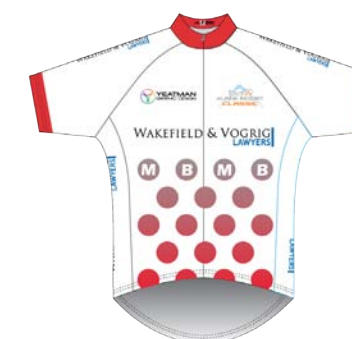
B Grade Masters