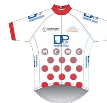
C Grade Masters