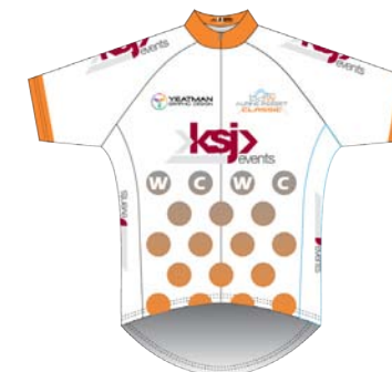
C Grade Women