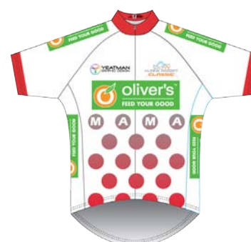
A Grade Masters